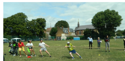
Tug of war!