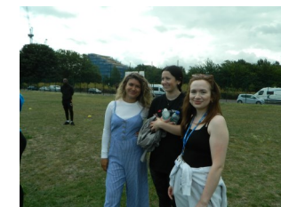
SILS staff enjoying the day